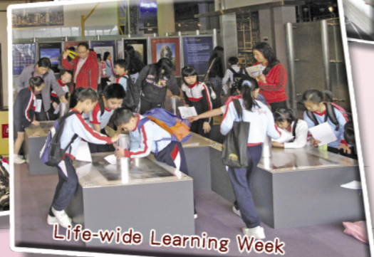
Life-wide Learning Week