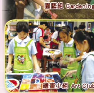
繪畫小組 Art Club