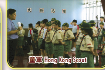
童軍 Hong Kong Scout