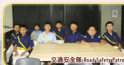
交通安全隊 Road Safety Patrol