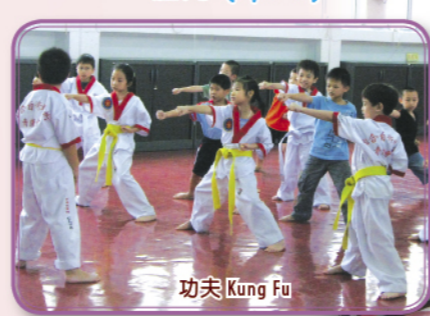
功夫 Kung Fu