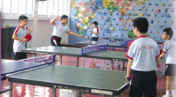
乒乓球 Table Tennis